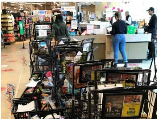
WESN volunteers shopping for shut-in seniors

Last March West End Seniors' Network (WESN) became one of COVID-19's Community Response Hubs of the Safe Seniors, Strong Communities program*. WESN will continue in this role until at least March 31, 2021.