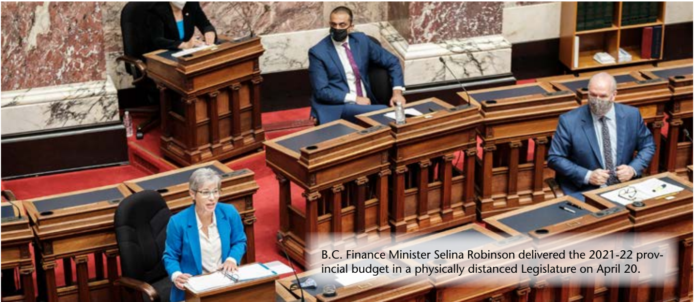
B.C. Finance Minister Selina Robison delivered the 2021-22 provincial budget in a physically distanced Legislature on April 20.