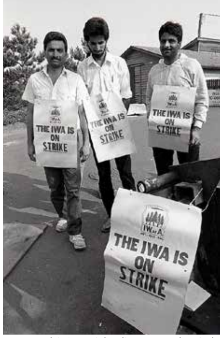
IWA Local 1-357 picket line at North Mitchell Lumber, 1987.