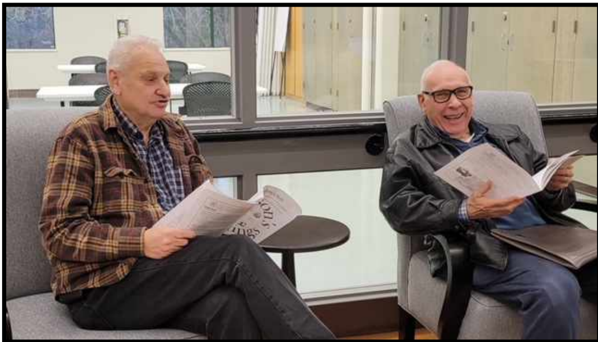
Members of the Langley Seniors Resource Centre enjoy the winter issue of COSCO News