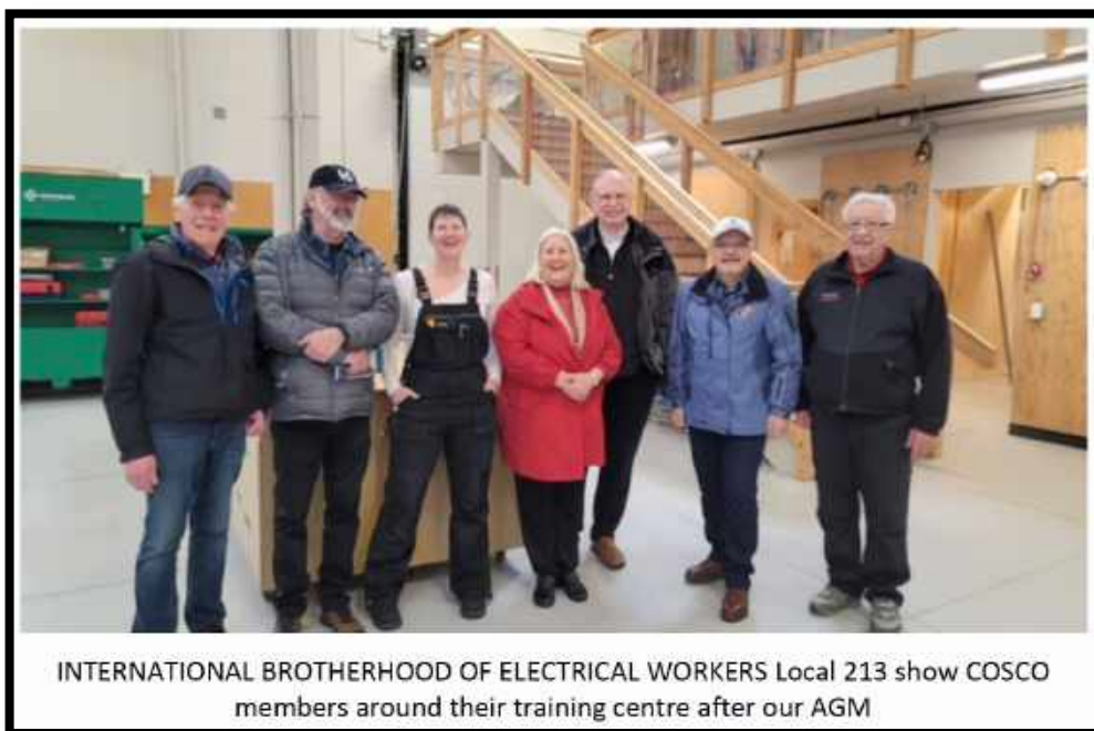
INTERNATIONAL BROTHERHOOD OF ELECTRICAL WORKERS Local 213 show COSCO members around their training centre after our AGM