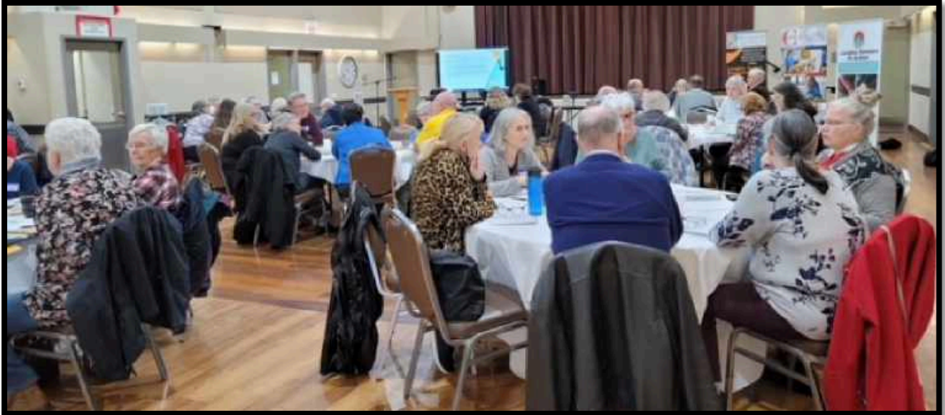
Participants at the Passing the Torch event held in Langley

will be holding an in-person convention in Ottawa in late September 2023 – time to sharpen our pencils to draft resolutions for the conference! Thank you for your support as we work together to meet the challenges of 2023.